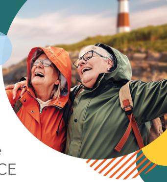
Not actual patients.

It's crucial to follow your doctor's instructions and not miss doses. Missing doses may negatively impact your treatment goals. Please talk with your doctor before doing or changing anything. Here are some tips to help you remember to take CALQUENCE twice a day: